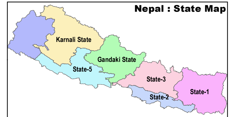
Bridge Status Summary (Karnali State)